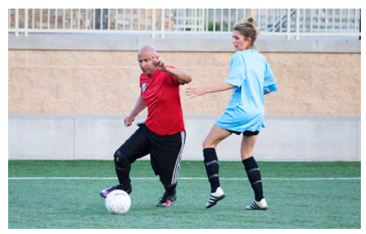
Copyright © 2017 American Youth Soccer Organization. All rights reserved.